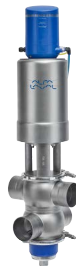
Figure 1. Alfa Laval Unique Mixproof valve with the ThinkTop V70 control unit.

consumption during production. Cleaning process equipment, such as mixproof valves, can contribute significantly to reduced water use. Alfa Laval can help manufacturers realize substantial water savings – without compromising product hygiene or safety – by using Alfa Laval Unique Mixproof CP-3 valves with innovative ThinkTop control tops.