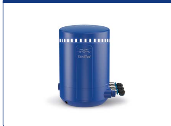
Figure 5. Alfa Laval ThinkTop V70.

The assumption is that the CIP system is in satisfactory working condition and that there is continuous flow at sufficient pressure. The compressed air capacity must also be sufficient to ensure increased valve activation frequency.